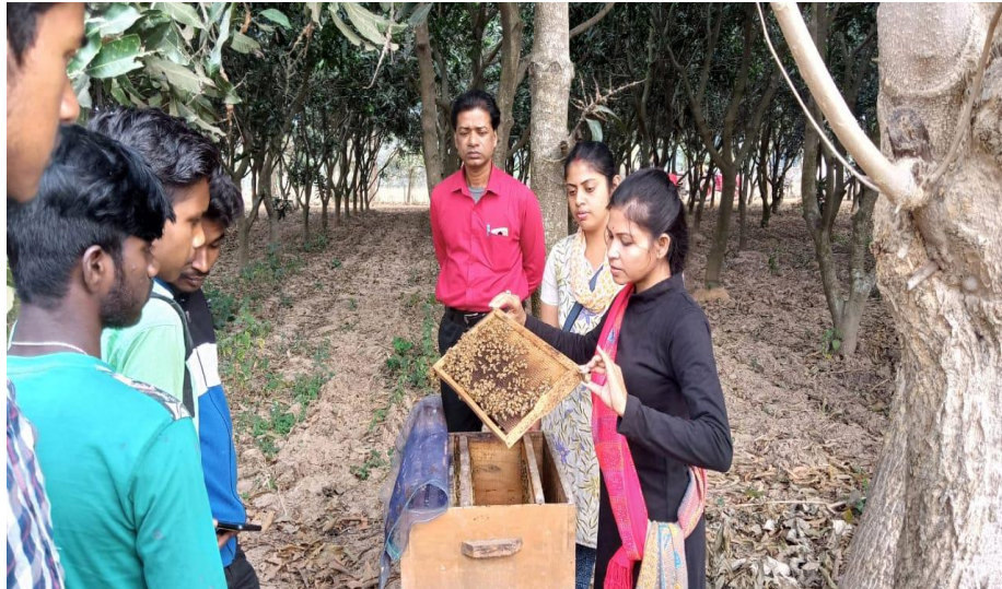
Bee Keeping Unit at Rathindra Krishi Vigyan Kendra for promoting Natural Farming